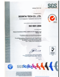
SGS ISO 9001 Certificate TW12/11128