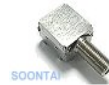
SOONTAI MX27 series