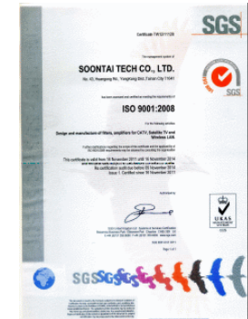
SGS ISO 9001 Certificate TW12/11128