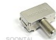
SOONTAI MX13 series