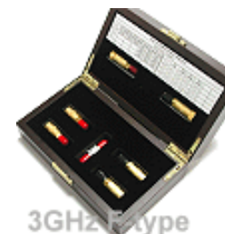
3GHz Type Standard Kit